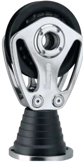
HC9076 HC9081 HC9086 HC9091 HC10102