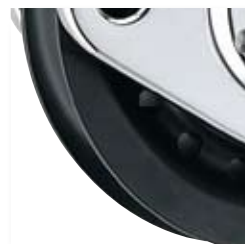
The ultra-light composite bearing construction (ULC) allows a narrower sheave.