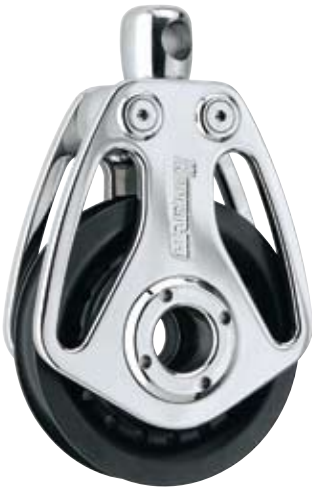
HC9077 HC9082 HC9087 HC9092