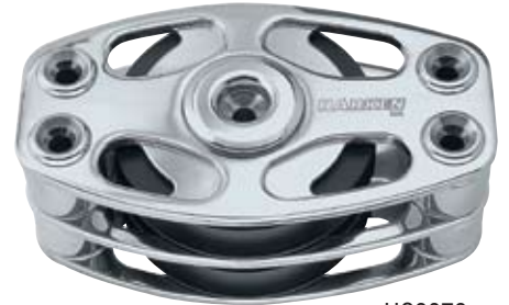
HC9079 HC9084 HC9089 HC9094