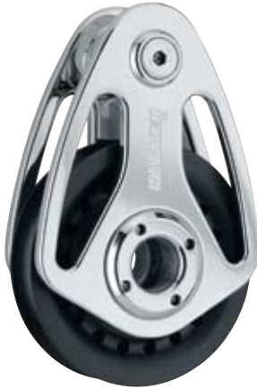
HC9078 HC9083 HC9088 HC9093