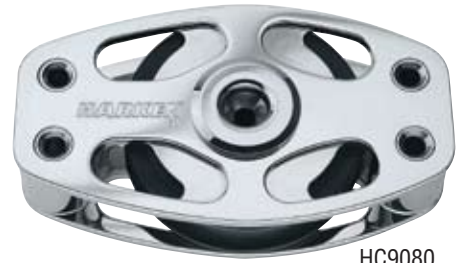
HC9080 HC9085 HC9090 HC9095