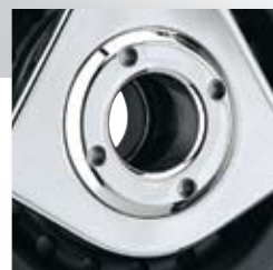
The Teflon ® -impregnated ultra-light composite bearing system (ULC) rides on a heat-treated 17-4 PH stainless steel inner race.

Blocks can be disassembled for rigging maintenance and part replacement.