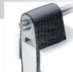
G-10 bobbins are laminated into the deck, eliminating track fasteners to reduce weight

PCRX travelers should be flushed clean with fresh water. Torlon® rollers are held captive for easy installation and maintenance.