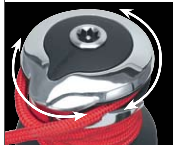
Activated remotely by twin in/out buttons, the Radial Rewind lets you safely ease and trim highly-loaded sails in both directions without ever taking the line out of the self-tailer