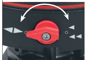
A simple flip of the red knob on the winch base turns on the rewind feature