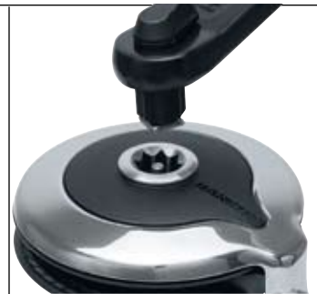
A Harken® locking handle inserted into an unloaded winch automatically disconnects the motor gear for manual operation