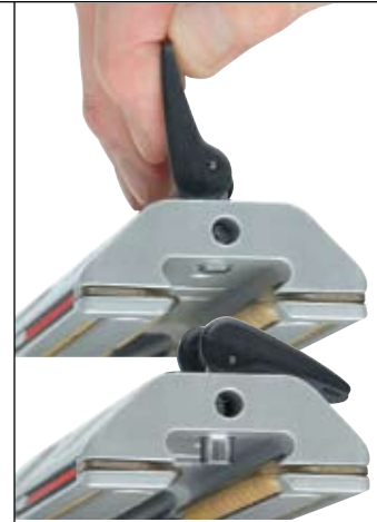
Pinstop car allows movement of cars along track. Open to move; close to lock in place.